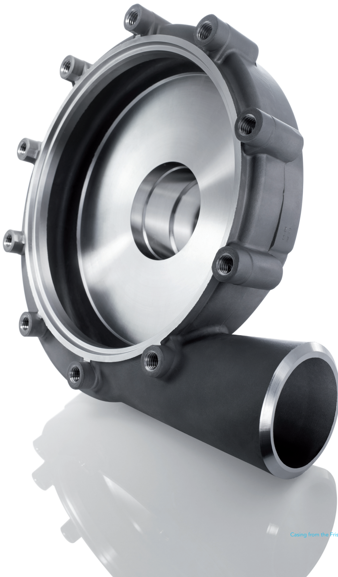
Casing from the Fristam FPH