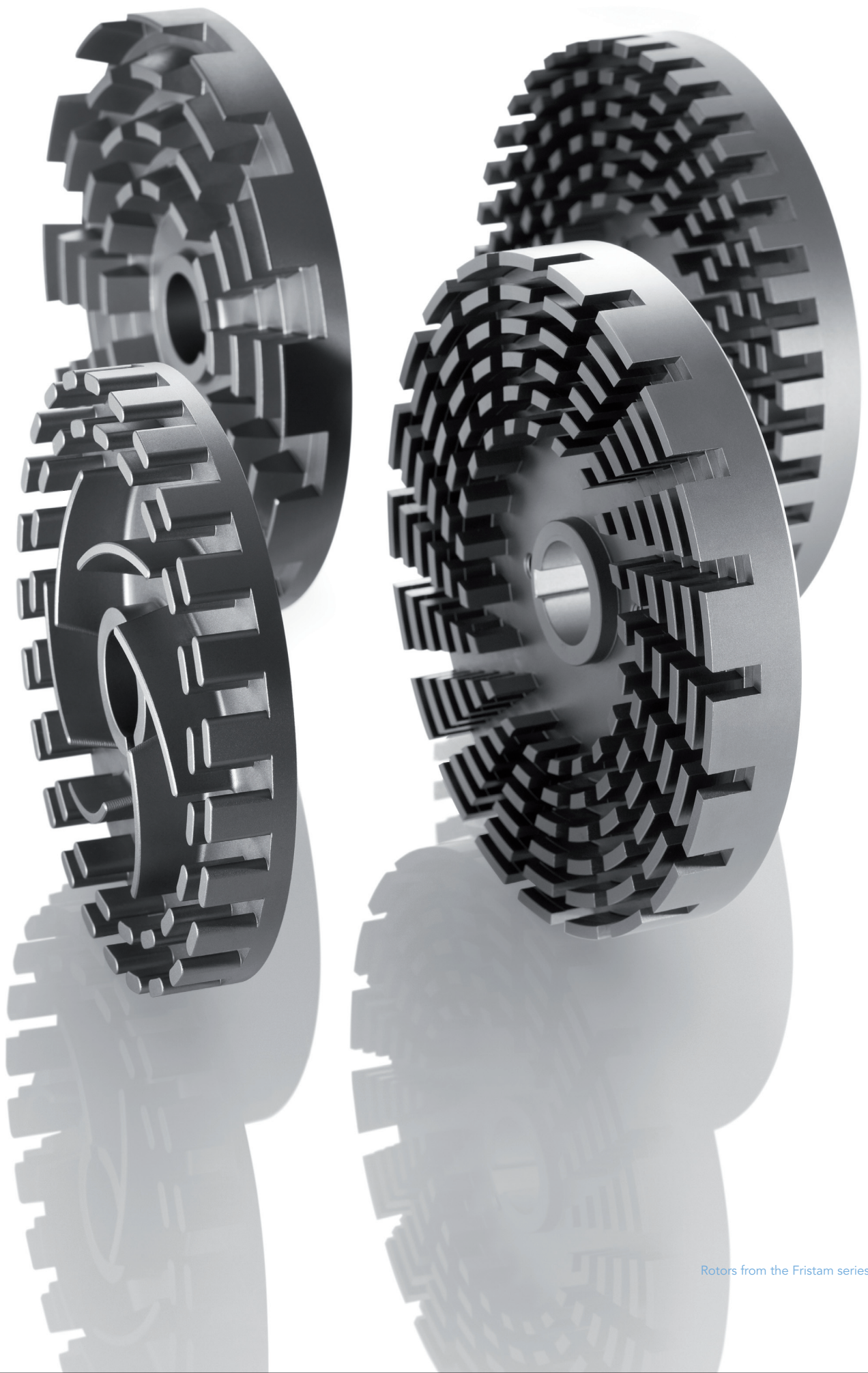
Rotors from the Fristam series FSP